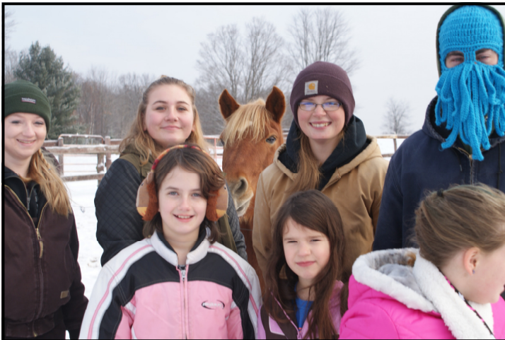
Some staff and kids in our Hope Riders Program

"And my God will meet all your needs according to the riches of His glory in Christ Jesus." - Philippians 4:19